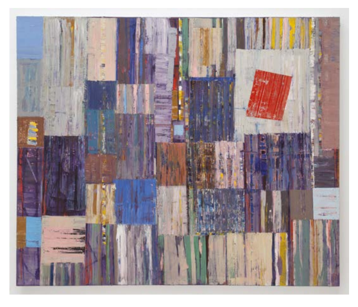
Parallel Portions, 2017 oil on canvas 72 x 87 inches