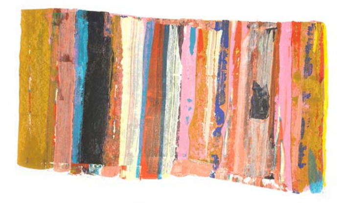
No. 26 - From the Parallel Spaces Series, 2017 acrylic on paper 24 x 37.5 inches

Presented in dialogue with these works are a series of new oil paintings. Some feature colorful grid-like compositions ( Parrallel Portions , 2017), a tightly controlled series of verti-