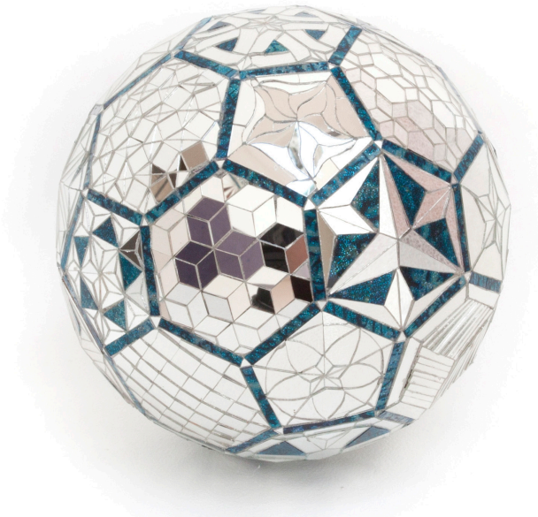
Monir Farmanfarmaian, Mirror Ball , 2010 mirror, reverse-glass painting, plaster on wood 8.5 x 8.5 x 8.5 inches