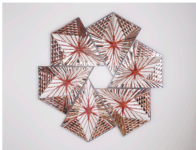
Monir Farmanfarmaian, Tir (Convertible Series) , 2015 mirror, reverse-glass painting, plaster on wood 6 elements: 24 x 27 x 6 inches each; overall: 63 x 63 x 6 inches