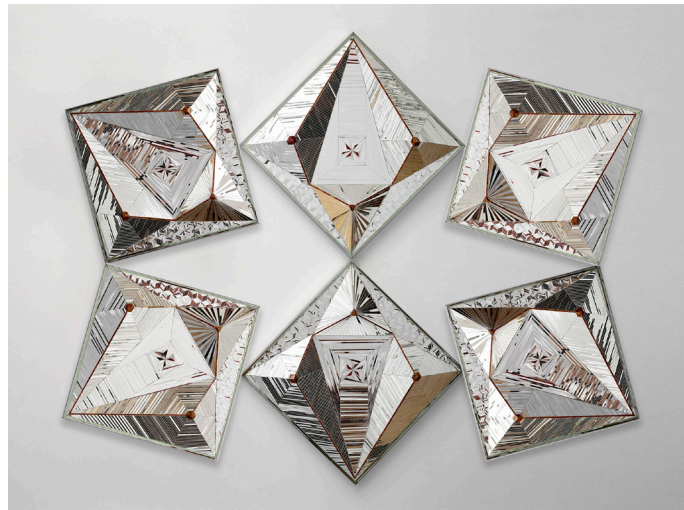
Monir Farmanfarmaian, Ordibehesht (Convertible Series) , 2015 mirror, reverse-glass painting, plaster on wood 6 elements: 20 x 20 x 5 inches each; overall: 57 x 72.5 x 5 inches

Several of the Convertible works included in this exhibition are named for the months of the Persian solar calendar currently used in Iran. This observation-based timekeeping system begins each year on the vernal equinox, as determined by astronomical observations from Tehran. The complex geometry traced by the movements of the heavens