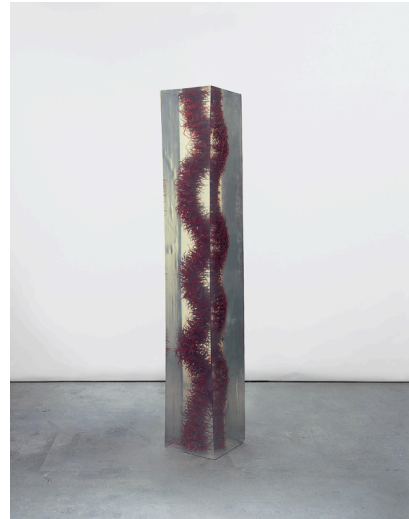
Phykos Glacialis Rosex