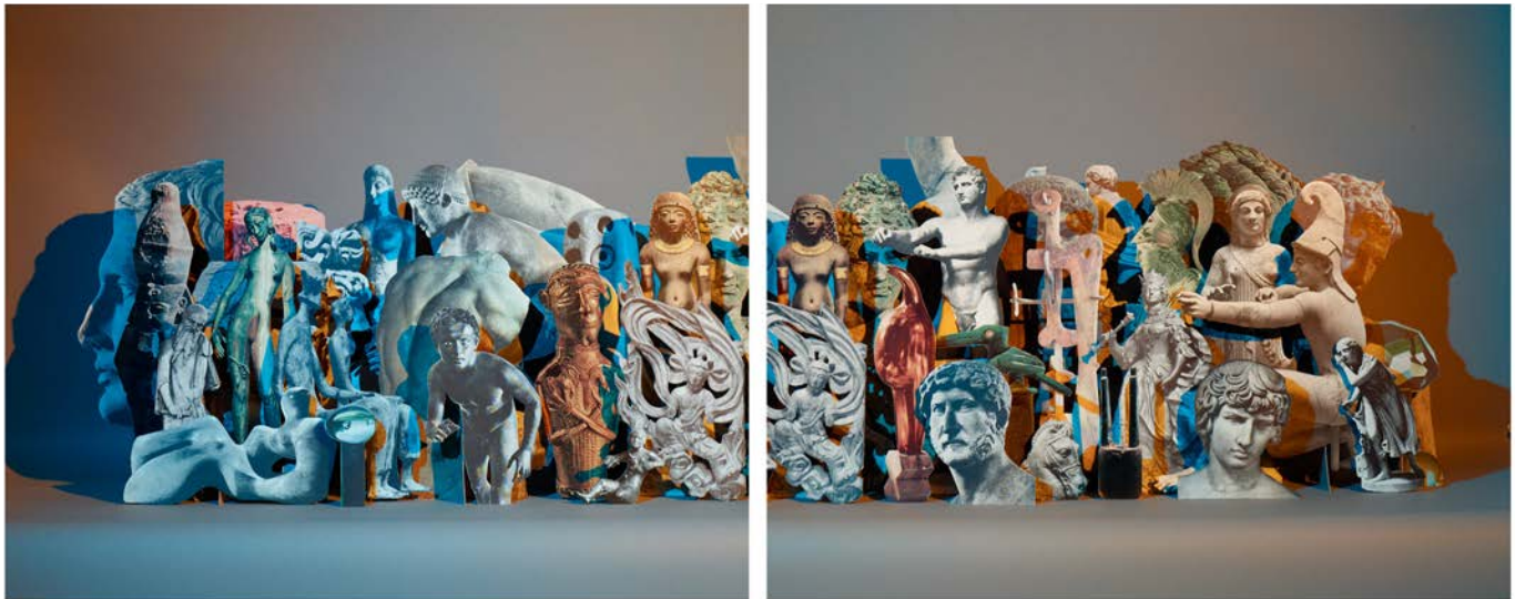
Matt Lipps, Untitled (Sculpture) , 2010 C-Print, diptych, 33 x 44 inches each

The figures in Matt Lipps' large-scale photographs are cut from pages of Horizon , a mid-century American art and culture magazine, and arranged into complex groupings that amplify the role that images play in transmitting the dominant myths of a culture.