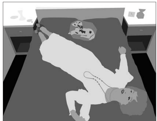
Kota Ezawa, Untitled Film Still , 2005 duratrans transparency and lightbox, 22 x 28 inches, edition of 5 + 2 AP