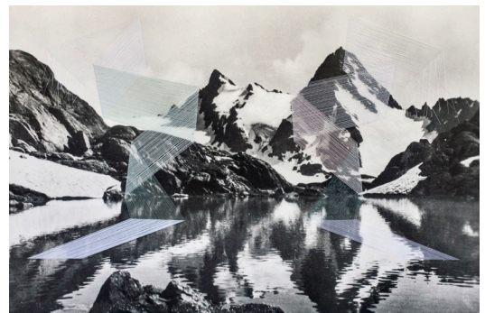
Maurizio Anzeri, Alps (Lake) , 2015 Embroidery on found photograph 31 x 46.5 inches