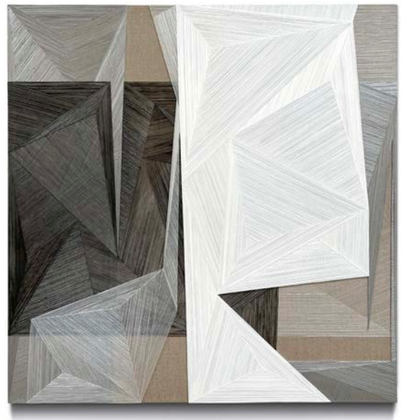
Robert Stone, Untitled , 2021 Acrylic and mixed media on linen-wrapped panel 36 x 36 inches