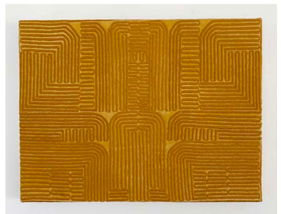
Aili Schmeltz, Butler , 2022 Acrylic and thread on canvas over panel 18 x 24 inches