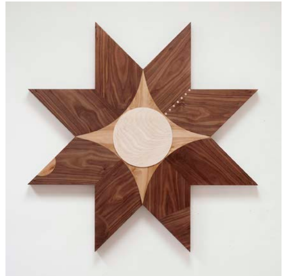
Lena Wolff, Full Moon Star , 2021 Walnut, beech, maple 42 x 42 x 2 inches

Won Ju Lim (b. 1968, lives and works in Los Angeles, CA) invites audiences to reconsider the built environment and its relation to memory, fantasy, and longing. With a sly nod to Donald Judd, her wall-hung sculpture Kiss 11 (2015) produces a cascade of colorful shadows when light passes through it. Within the piece are architectural models